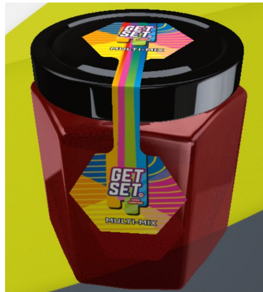
A fully prepared shape. Graphics are already applied.