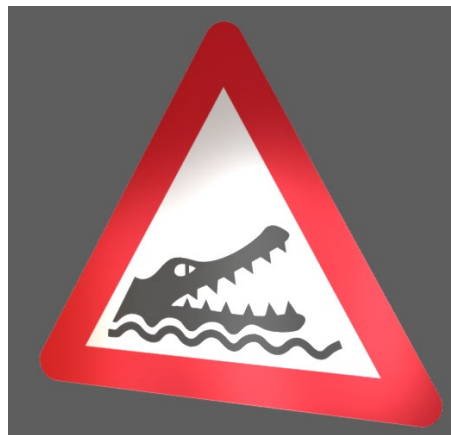
Flat Sheet cut to the cut lines metallized film