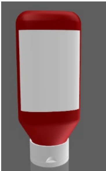
A prepared shape. Background and rigid container are determined by the Collada file. A blank area determines where the graphics will come

You can make fully prepared shapes with the Esko Studio applications and with Esko ArtiosCAD. From these applications, you export a Collada file and you upload this to Share & Approve. The recent versions of Studio Designer have a connector to Share & Approve for your convenience