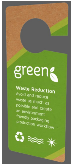
Flat Sheet Cut to the cut lines Matt coated paper

Following are examples of what is possible: