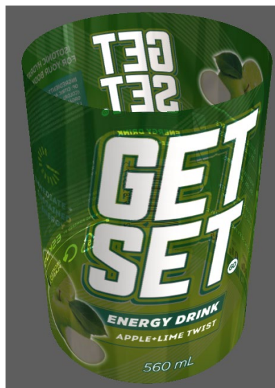
Curved sheet, angle 360 degrees Clear Film Label