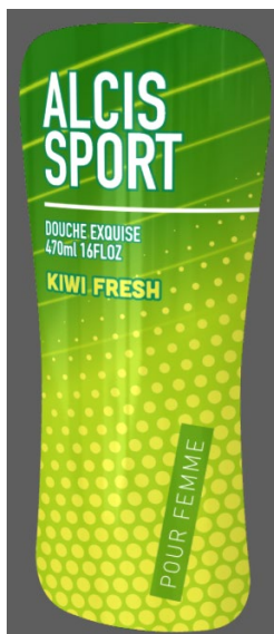
Curved Sheet, angle 60 degrees Cut to cut lines Gloss Coated Paper